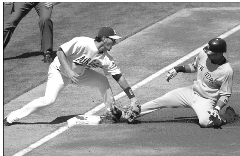
New York Yankee Robinson Cano attempts to slide into the tag of Oakland third baseman Eric Chavez Saturday.